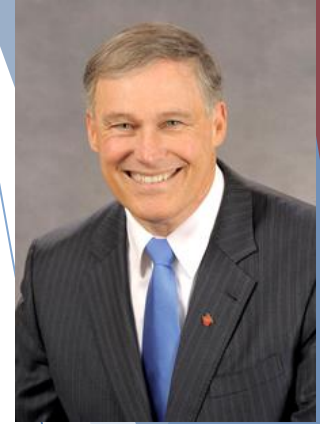
Governor Jay Inslee